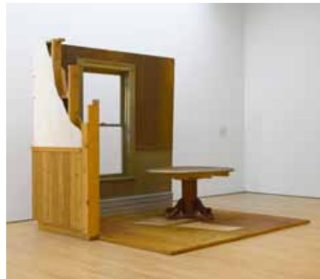
Murray Favro, Sunlight on Table and Floor , 1991. Wood, paint, metal, 259.1 x 301 x 264.2 cm assembled. Purchased 1992, National Gallery of Canada (no. 36139).