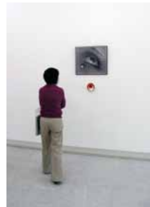
Luis Jacob, Cabinet (Mönchengladbach) , 2009. View at Städtisches Museum Abteiberg, Mönchengladbach. Courtesy of the artist and Birch Libralato, Toronto.