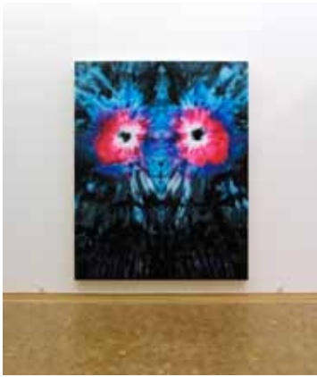
Luis Jacob, They Sleep With One Eye Open , 2008. Acrylic on canvas, 294 x 232 cm. (116" x 92")