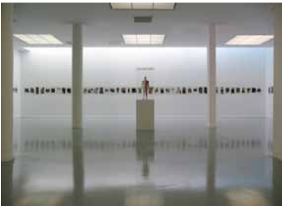
Luis Jacob, Album II , 2003-04. Image montage in 80 plastic laminate 45.7 x 30.5 cm. (18" x 12") each.