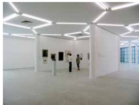
Luis Jacob, Cabinet (Mönchengladbach) , 2009. View at Städtisches Museum Abteiberg, Mönchengladbach.