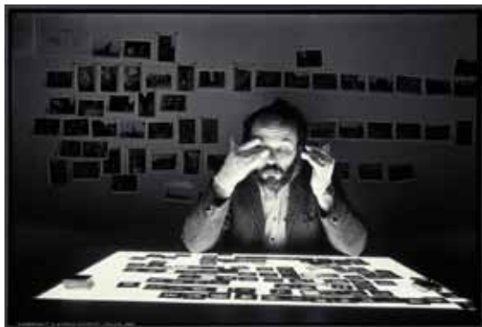
File: Michel Campeau, Self-portrait at the Light-Table, Studio, 1984 , printed 1989. © Michel Campeau / SODRAC (2011). Photo © NGC / CMCP.