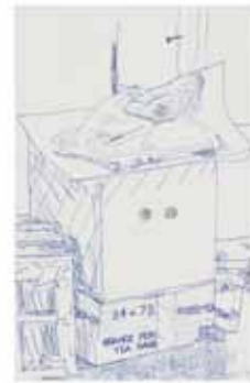
Luis Jacob, Untitled , April 4, 1995. Ballpoint-pen ink and pencil on paper 21.6 x 14 cm. (8" x 5")