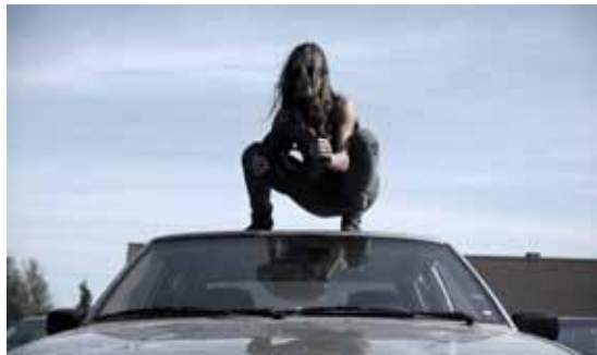
Geoffrey Pugen, Sahara Sahara , 2009. Video still, 2 channel HD video, 5min 30.