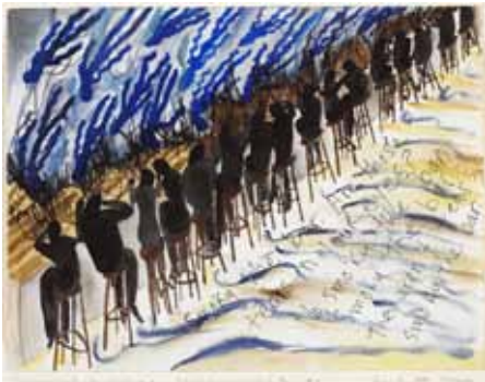
Sandra Meigs, Purgatorio, A Drinkingbout (Series of Drinkers - Smokey The Bar, No. 2), 1981. NGC Collection