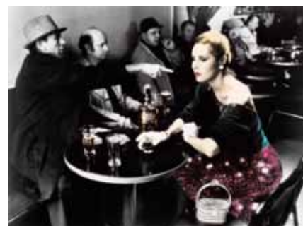
Barbara Cole, Tomorrow , 1984. Applied c-print.