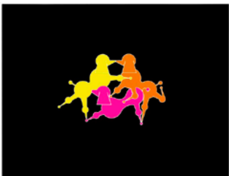
General Idea Mondo Cana Kama Sutra , 1983, printed 2001 Serigraph on wove paper NGC Collection. © General Idea