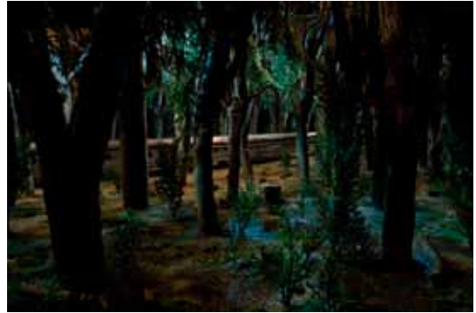
David Hoffos, Scenes From the House Dream: C.P. Fail , 2008.