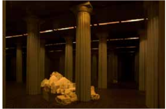
David Hoffos, Scenes From the House Dream: Hallroom , 2008.