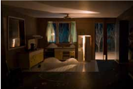
David Hoffos, Scenes From the House Dream: Winter Kitchen , 2007. Image courtesy of the artist.