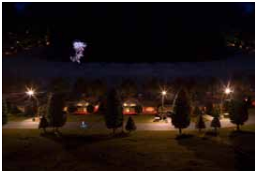
David Hoffos, Scenes From the House Dream: Circle Street , 2003.