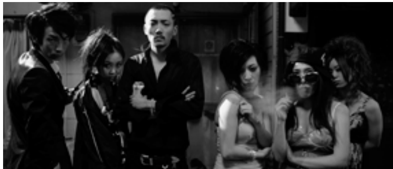
Chris Chong Chan Fui + Yasuhiro Morinaga HEAVENHELL , 2009.