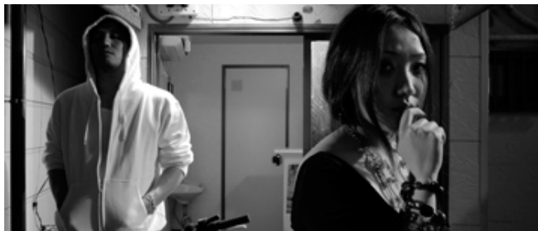
Chris Chong Chan Fui + Yasuhiro Morinaga HEAVENHELL , 2009.