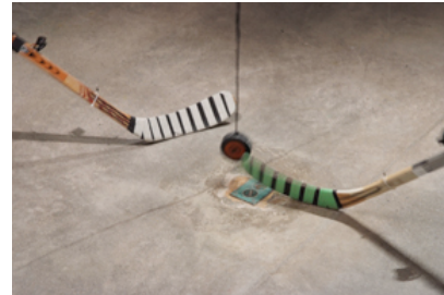
Jean-Pierre Gauthier Nul/Flirting with the Puck (detail), 2008. Courtesy of the artist. © Jean-Pierre Gauthier Photo Credit: Carlton Parker