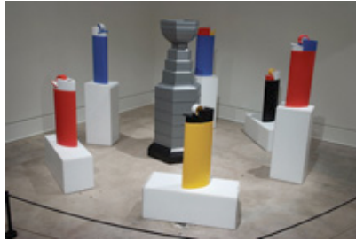
James Carl The Original Six , 1998 Corrugated plastic Collection of the artist © James Carl

The following press ready images are available for download from our website. Please email Fayiaz Chunara at fchunara@moCCA.ca for access.