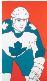
Charles Pachter Hockey Knights in Canada , 1984. Collection of the artist. © Charles Pachter