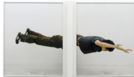
Tim Lee Untitled (No.4, 1970) , 2008.